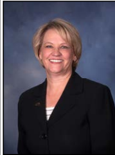
MAYOR DEBBIE WINN

January has flown by at record speed! I am still waiting for “winter” to arrive with sufficient snowfall to provide us the water we need to get us through the hot summer.